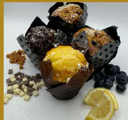
Warm, Soft, Tasty