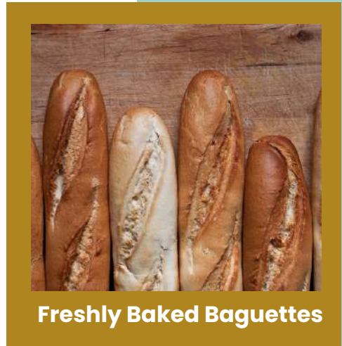
Freshly Baked Baguettes