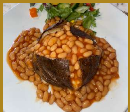
Cheese or Beans on Top?!